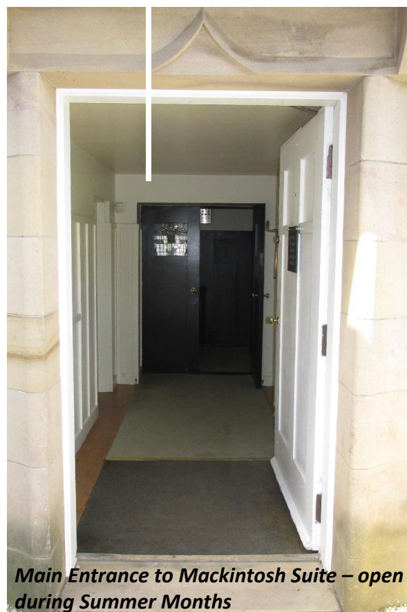
Main Entrance to Mackintosh Suite – open during Summer Months

Once you come in the main door there are 2 sets of double doors before you reach the welcome desk. Both doors measure 120cm wide and have a small downwards lip. The flooring in the entrance way (and throughout the house) is carpet with wooden flooring around the edges. The carpets are not too thick. The lighting as you enter is quite bright due to the natural light.