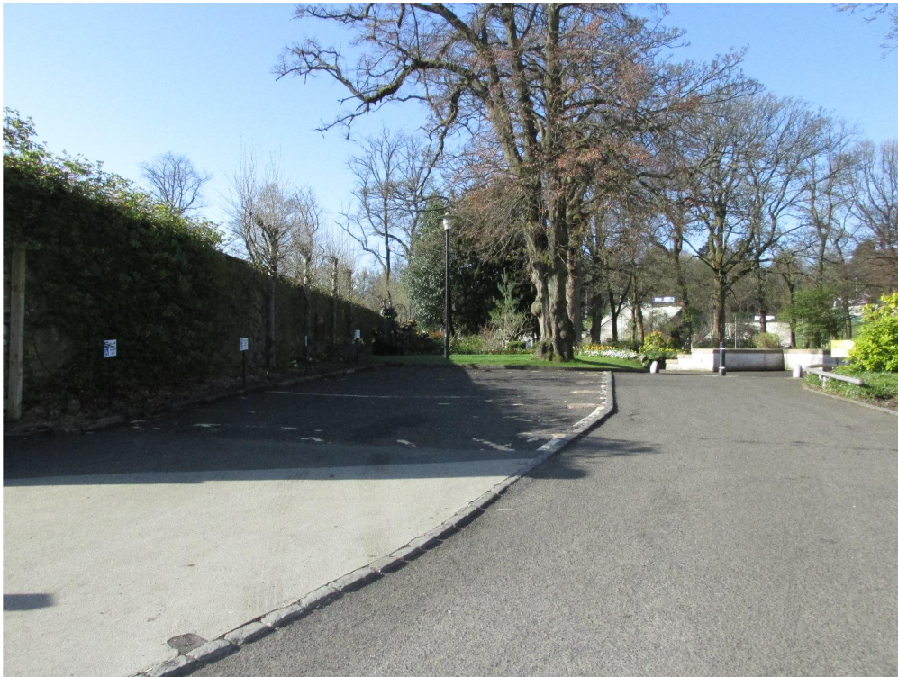
Accessible Parking Spaces

We have 3 accessible parking spaces available at the venue which are marked with a sign and yellow markings. Please note there is a small kerb at these spaces. There is a direct pathway from these spaces.