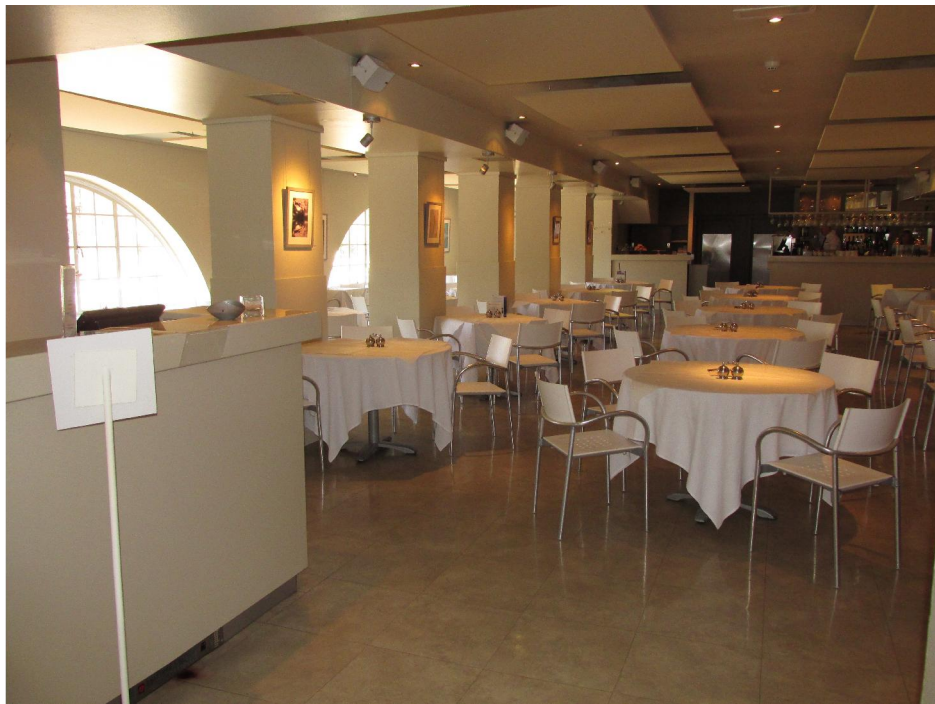
The café counter at the entrance is 120cm high

Within the café all the tables and chairs are moveable if further access space is required.