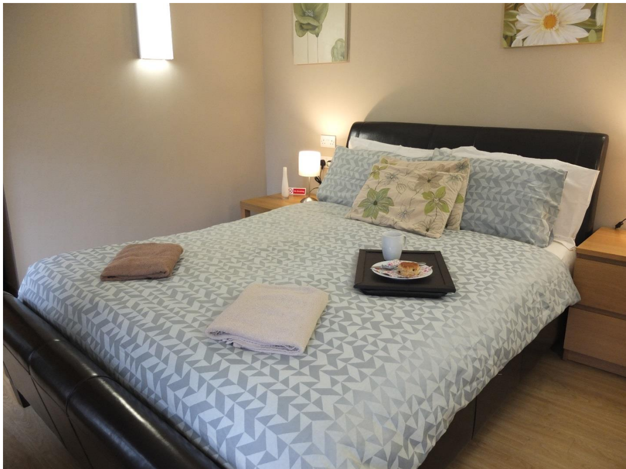
Image: Double bed with tea tray

The room is lit by two windows and at night by wall mounted lights. Low level lights can be switched on from the panel to the left of the bedroom door.