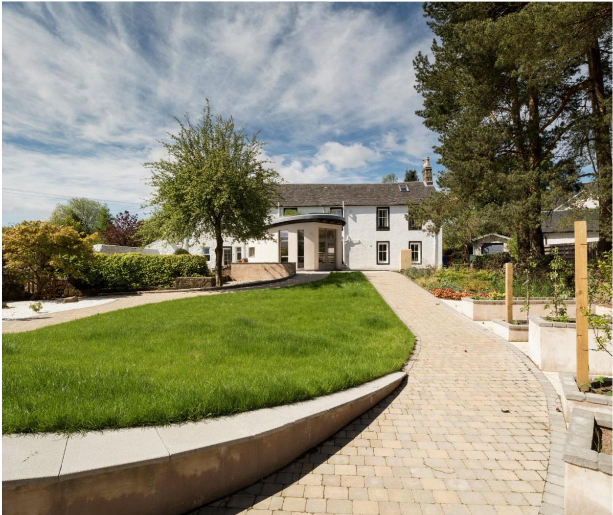
Image: Clober Farm from the bottom of the garden.