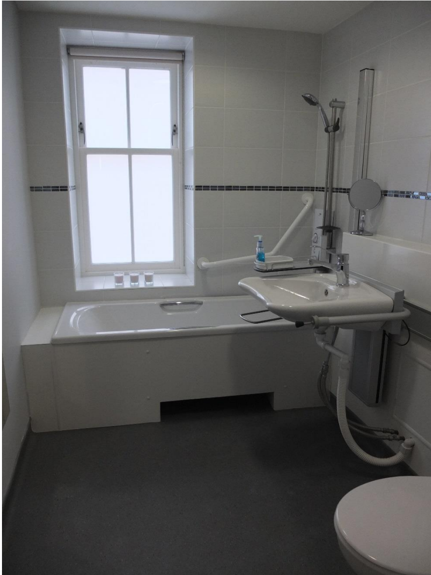
Image: Bath with adjustable sink and toilet.

There is an over bath shower with the shower cord located on the left hand side of the bathroom door. Toilet with left-hand transfer and 1000mm space in front, a height-adjustable sink with a lever tap from 650mm to 860mm from the floor. There are horizontal and vertical grab rails at the WC.