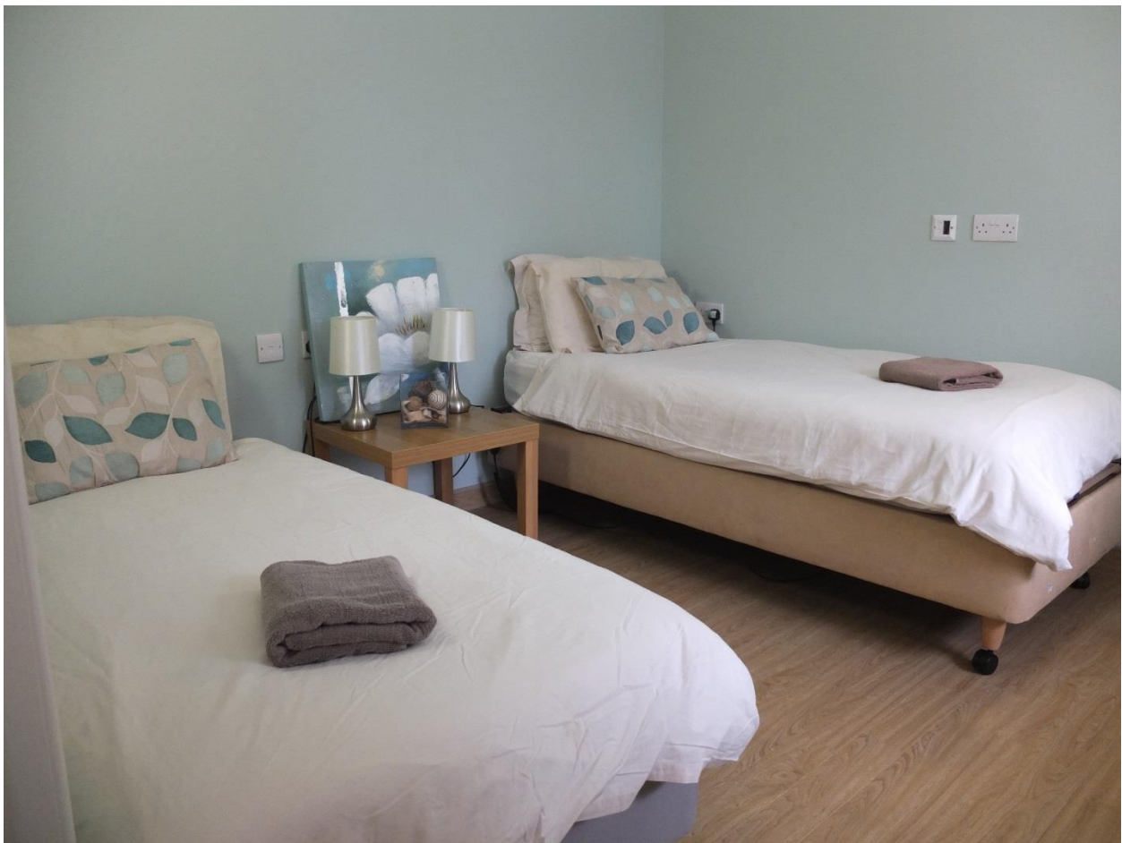
Image: Two single beds and duck egg painted walls

The bedroom looks out onto the back garden.