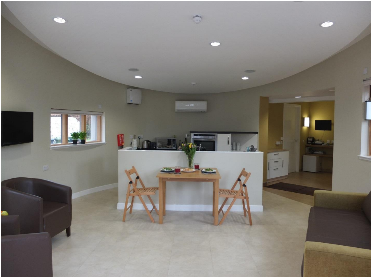
Image: Table set for a meal in open plan living room.

There is an extendable dining table at a height of 740mm from the floor which can sit 6 people. There are two folding chairs. The flooring is tiled with underfloor heating.