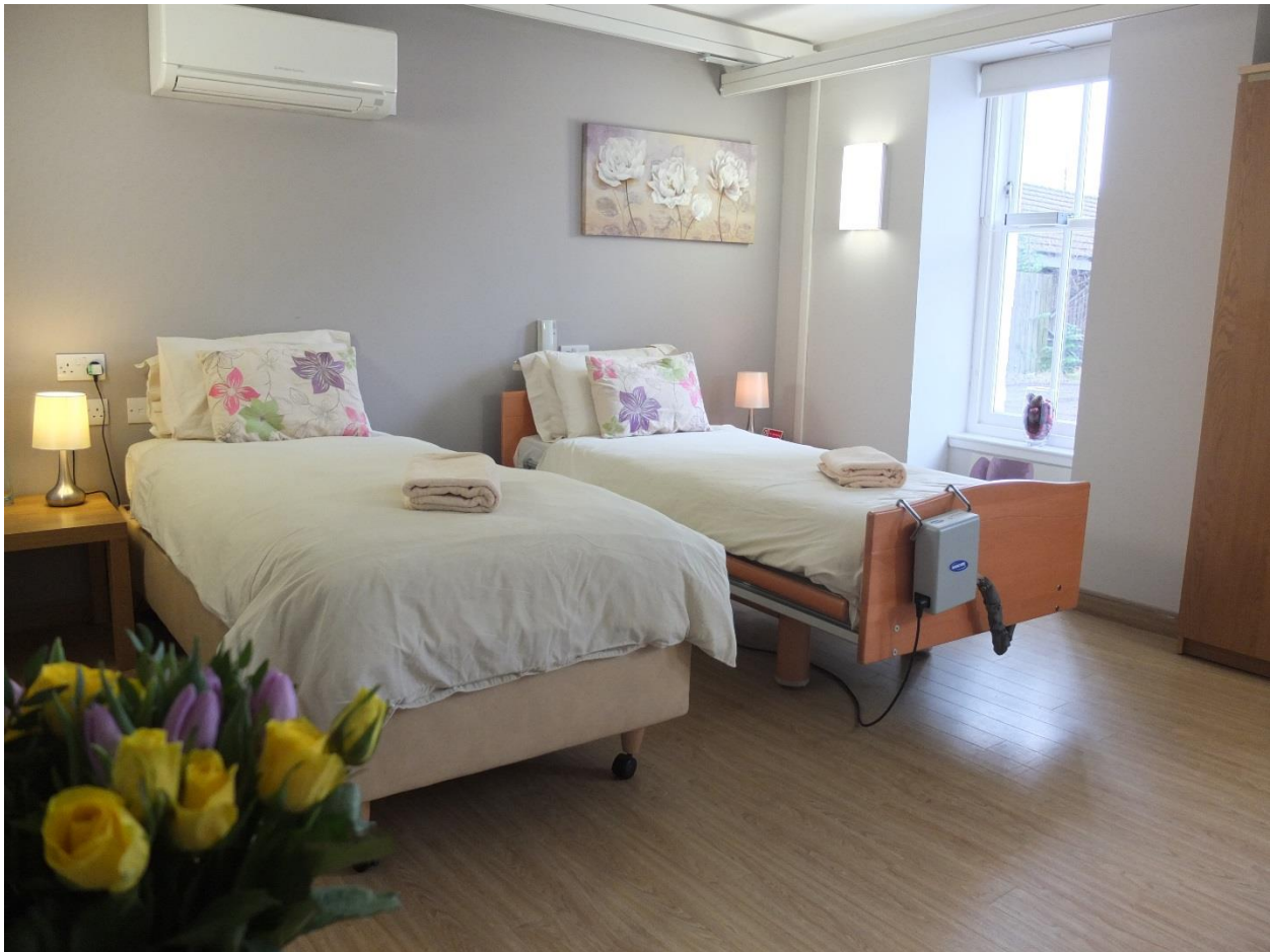
Image: Fully adjustable profiling bed and profiling bed. Ceiling tracking hoist just in view.

The windows look out onto the landscaped gardens.