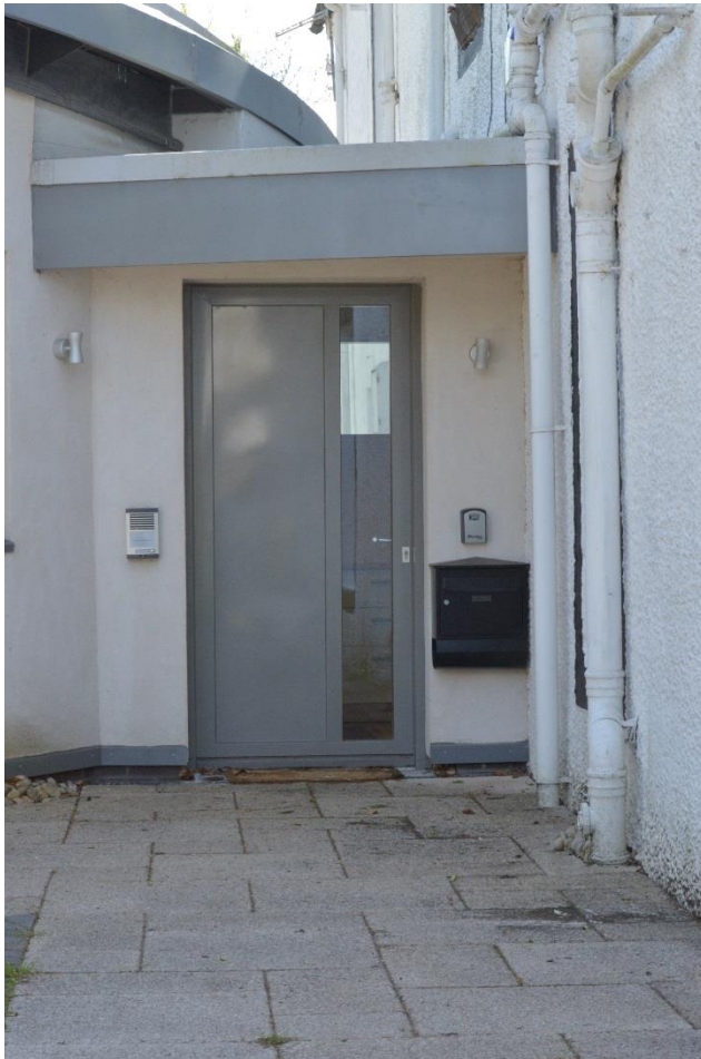
Image: Main Door

The front door leads into a spacious entrance hall with a storage unit, Wii, and television on the wall. There is also a DVD player and an iPod docking station. The hall is well lit by wall lights and low level sensor lights throughout. The passageway is 900mm wide with wooden laminate flooring. We have a colour contrast between walls and doorframes. Fire exits are illustrated by the poster on the wall.