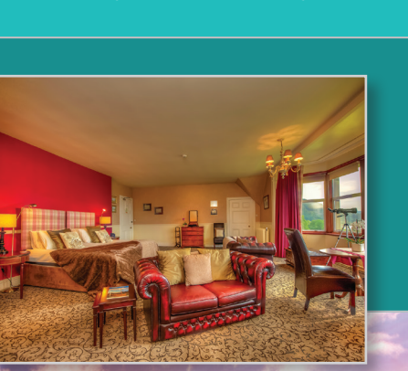
All our 25 bedrooms are en-suite and have spectacular sea views...